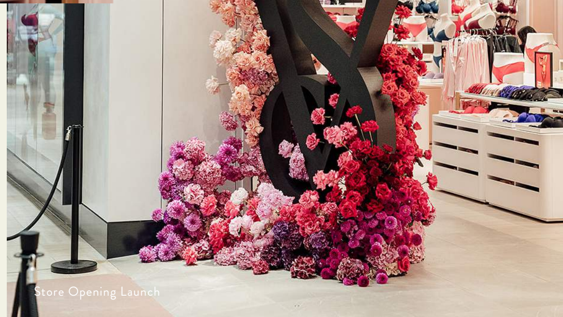
Store Opening Launch