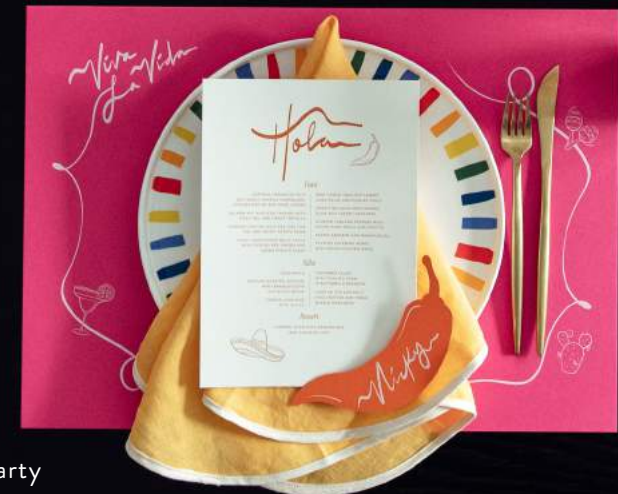
Private Dinner Party